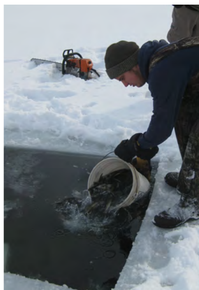
To their new home in EBL