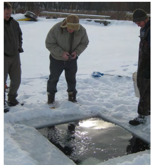
Hope they like their new home!

The 2013 Fish Stocking Story in pictures. The next stocking in 2014 is by the DNR.