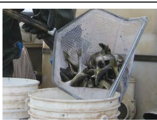
Fish-stocking in Progress This year it was by hand, net and buckets. Big fingerlings heading for the waters of East Battle Lake.

East Battle Lake stocks the lake each odd-numbered year while the DNR is scheduled on the even-numbered year. We pay $1 per fish so the lake is rich now in the wall-eye infants.