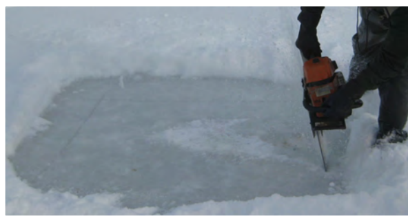
The door is soon to be opened to welcome the fingerlings. The hole is being cut so the 'dumping' can begin, rather the 'stocking' of the 2013 walleyes.

Protecting water quality for fishing, boating, swimming for us . . . and for the next generations