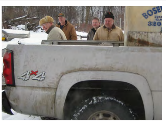
Fingerlings are chauffeured onto the lake on a cold December day

The walleye fingerlings we buy for fish stocking arrived in East Battle Lake this year in December and they were not 'just' dumped into the lake as usual. This time they got more personalized service from those assisting in the job!