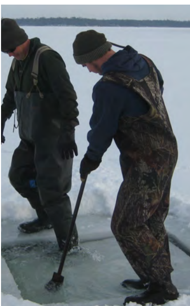
Will this ice get loose?

Contact me at sue@sueellengifts.com or 218-583-4626